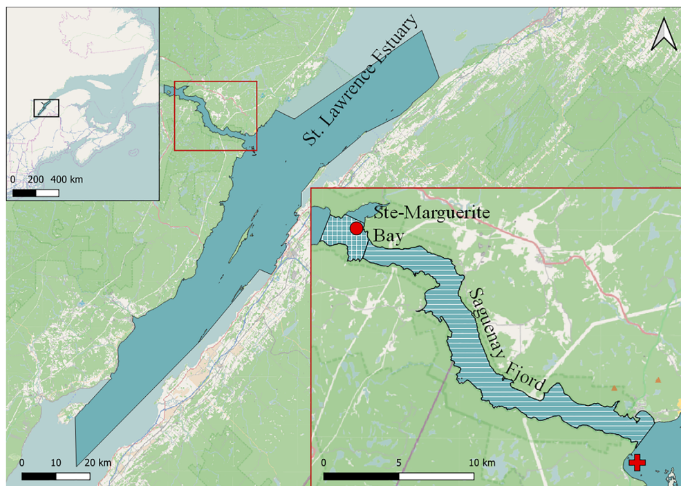
FIGURE 1 Critical habitat of St. Lawrence belugas (DFO, 2012) and extent of the study sites in the Saguenay St. Lawrence Marine Park in Quebec, Canada. In 2016 and early 2017, sampling occurred aboard a research vessel in the Saguenay Fjord (horizontal white hatching). In late 2017 and 2018 sampling occurred from a research platform (indicated by the red circle) in Sainte-Marguerite Bay (white cross-hatching). The red cross shows the approximate location of tidal measurements.

We focused on the Saguenay Fjord, a tributary of the St. Lawrence River, and Sainte-Marguerite Bay, a small bay within the fjord that has been identified as a beluga high-residency area (Figure 1; Lemieux Lefebvre et al., 2012; Ménard et al., 2018). Sainte-Marguerite Bay has long been recognized as an important habitat for St. Lawrence belugas, particularly females with young, and has been hypothesized to function as a feeding ground, rest area, breeding ground, nursery, or social hub (Michaud et al., 1990; Pippard & Malcolm, 1978). Similar patterns of habitat use are observed in Arctic populations, where belugas congregate in shallow bays and estuaries in the summer to molt, rest, feed, care for young, and socialize (Anderson et al., 2017; O'Corry-Crowe et al., 2009; Smith et al., 2017). In contrast, the Saguenay Fjord appears to serve as a transit corridor connecting the St. Lawrence Estuary to Sainte-Marguerite Bay (Ouellet et al., 2021). We obtained a total of 1,846 focal observations of beluga calves and juveniles from the two sites, and identified a series of variables that, if related to maternal care and allocare, may allow us to infer the benefits of allocare to offspring and whether they are similar to the benefits of maternal care.