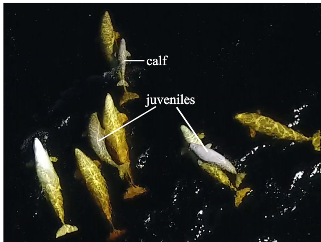
FIGURE 2 Three St. Lawrence beluga offspring (one calf and two juveniles) swimming in formation with adults. Offspring smaller than approximately half of adult body length were classified as calves. Offspring reaching half of adult body length or longer were classified as juveniles.

might also reflect alloparental behaviors. Indeed, allonursing has been observed among captive belugas (Hill & Campbell, 2014; Leung et al., 2010), and the discovery of a lactating, yet presumably post-reproductive female St. Lawrence beluga (Ellis et al., 2018; McAlpine et al., 1999) suggest that allonursing might occur in the wild. However, such behaviors are difficult to observe from UAV footage. Therefore, we focused exclusively on formation locomotion, which likely represents only one aspect of allocare among St. Lawrence belugas. Following Noren (2008), we determined that formation locomotion occurred when offspring swam in close proximity to an adult's flank, just behind its pectoral flipper (Figure 2), or below the adult's tailstock. During formation locomotion, the offspring is pulled along in the adult's slipstream, such that the pair move in almost perfect synchronicity. It is therefore straightforward to determine which adult is "carrying" each offspring, and to determine when offspring move in or out of an adult's slipstream.